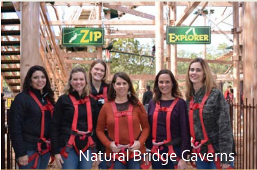
Natural Bridge Caverns