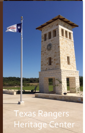
Texas Rangers Heritage Center