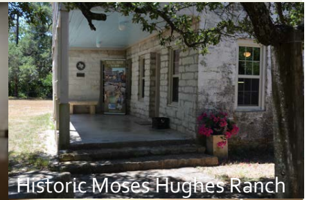
Historic Moses Hughes Ranch