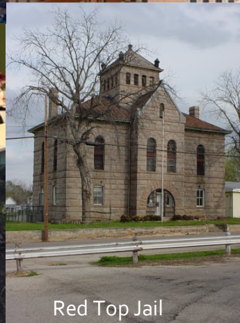
Red Top Jail