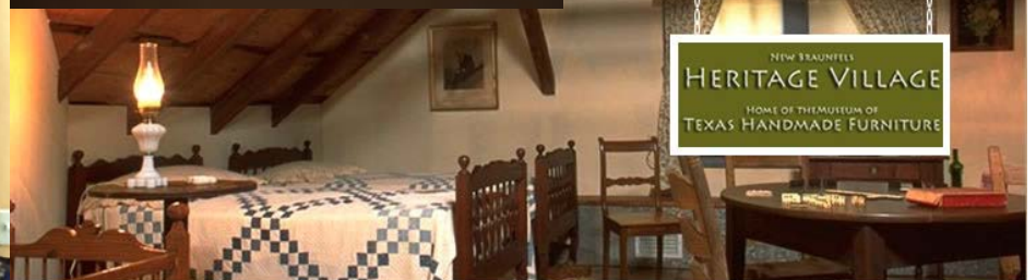
HERITAGE VILLAGE HOME OF THE MUSEUM OF TEXAS HANDMADE FURNITURE